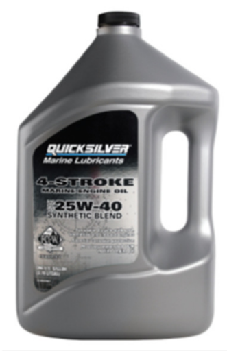
25W40 SYN BLEND